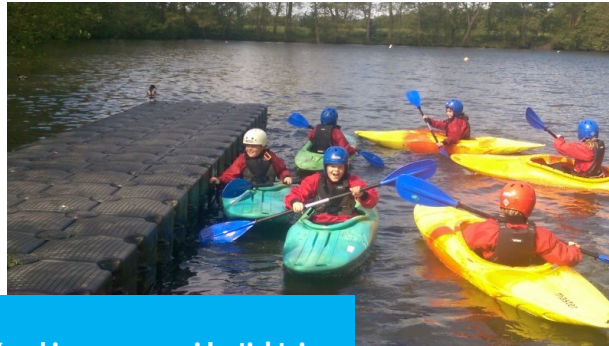
Kayaking on our residential trips.