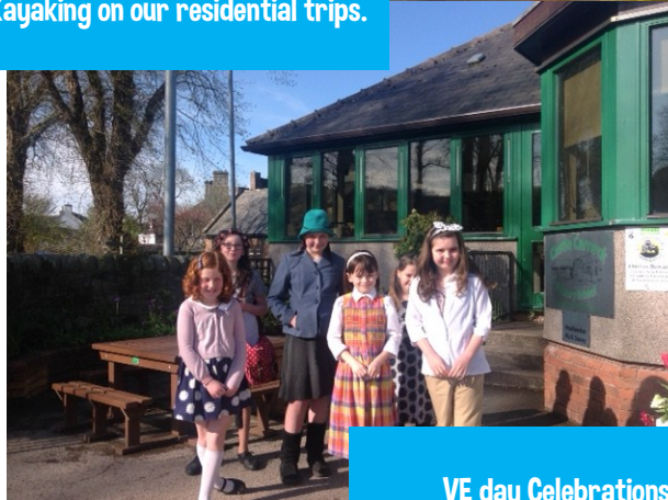
VE day Celebrations!

Castle Carrock Brampton Carlisle CA8 9LU